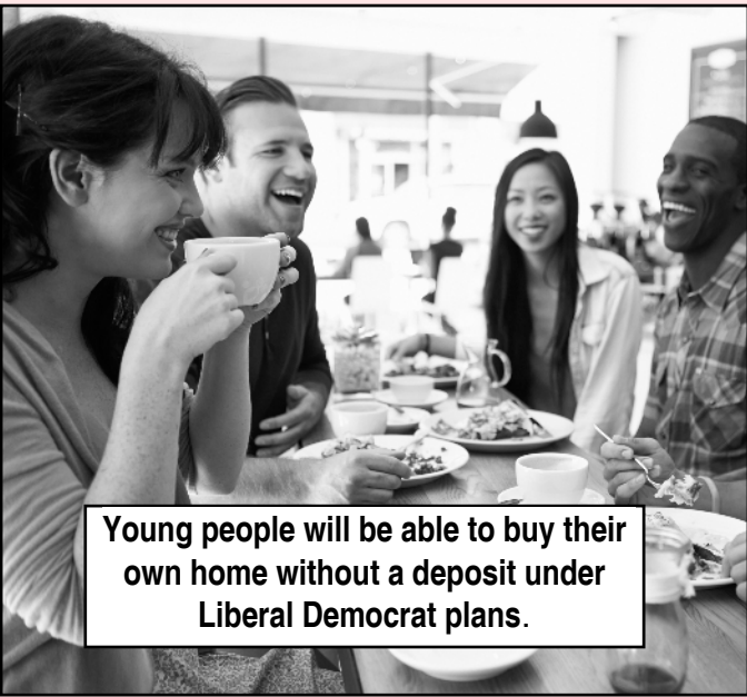
Young people will be able to buy their own home without a deposit under Liberal Democrat plans.

The Liberal Democrats will help first-time buyers get onto the property ladder without needing a deposit.