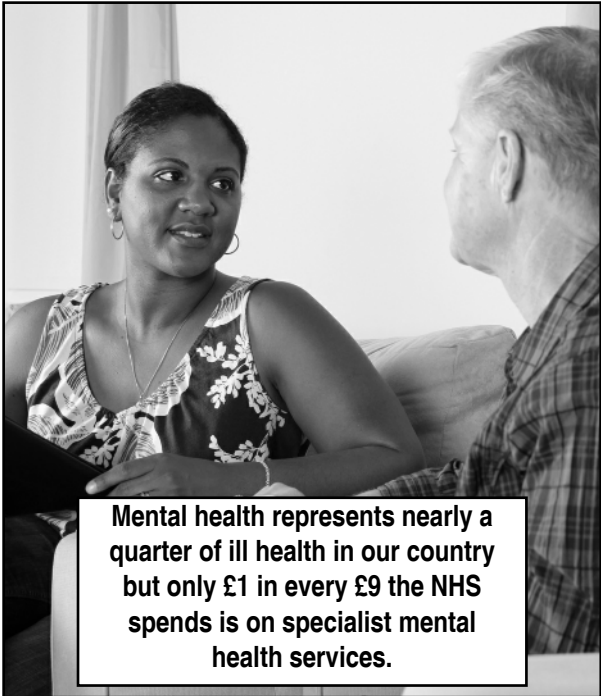
Mental health represents nearly a quarter of ill health in our country but only £1 in every £9 the NHS spends is on specialist mental health services.

One in four of us experience mental health problems at some point in our lives. But for too long it has been neglected by the NHS.