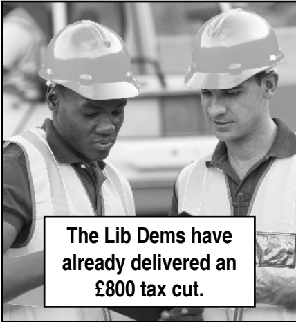
The Lib Dems have already delivered an £800 tax cut.

The Lib Dem plan will take almost another million workers out of Income Tax altogether. 30 million people will see lower taxes under the Lib Dems, ensuring everyone benefits from the economic recovery, not just those at the top.